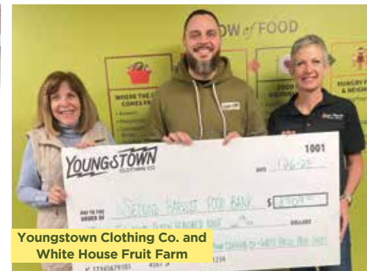
Youngstown Clothing Co. and White House Fruit Farm