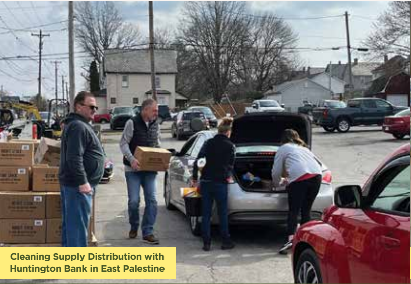
Cleaning Supply Distribution with Huntington Bank in East Palestine