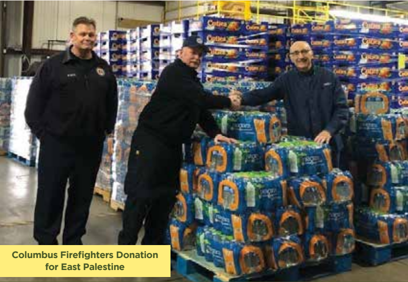
Columbus Firefighters Donation for East Palestine