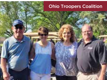
Ohio Troopers Coalition