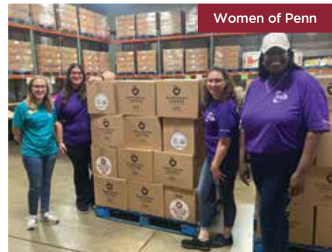
Women of Penn